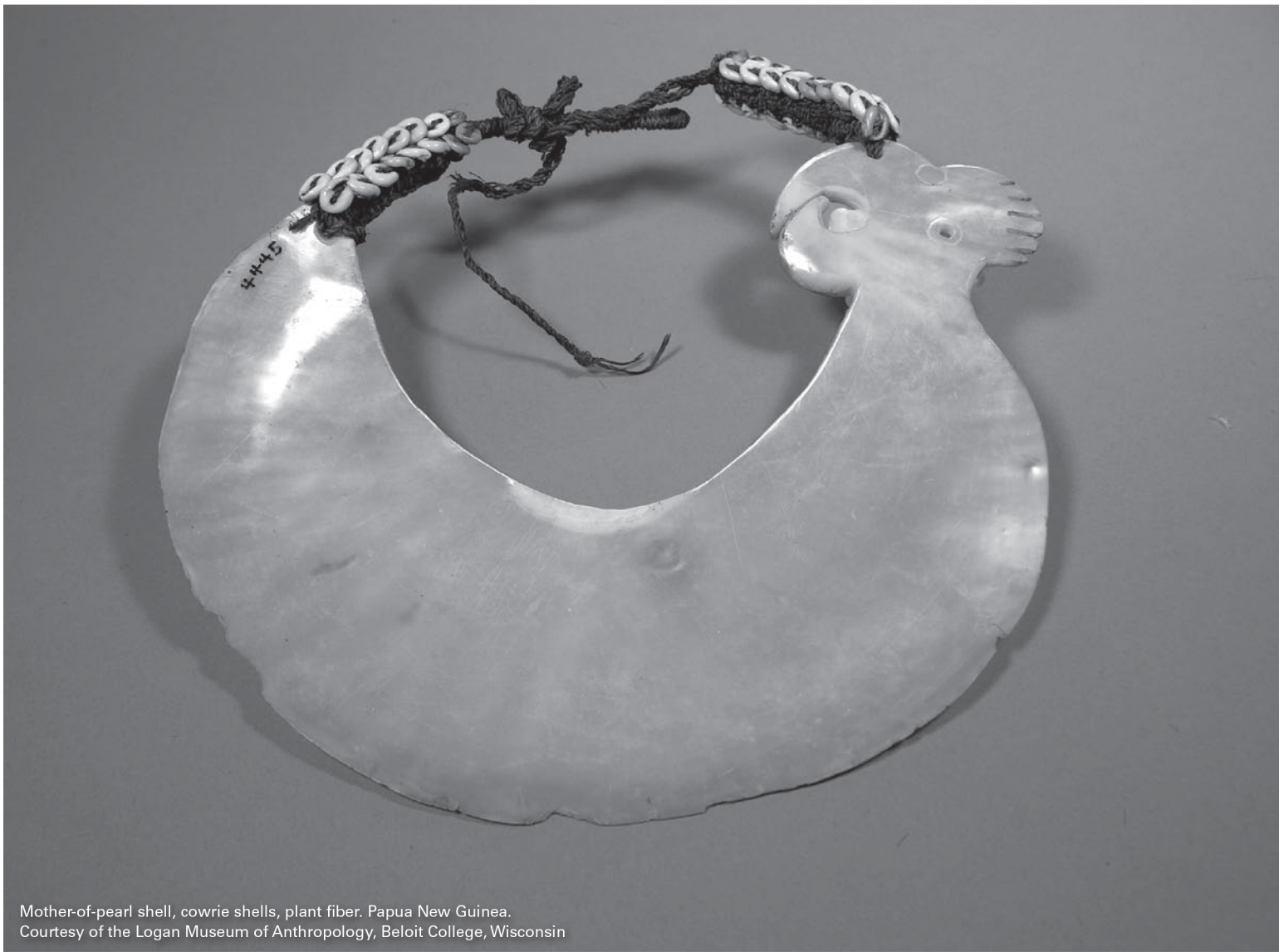
Mother-of-pearl shell, cowrie shells, plant fiber. Papua New Guinea.